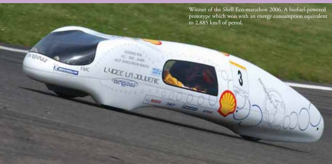
Winner of the Shell Eco-marathon 2006. A biofuel-powered prototype which won with an energy consumption equivalent to 2,885 km/l of petrol.

We began operating two monotowers in 2006. Each platform uses just 1.2 kilowatts of power per day. That is less than it takes to boil a kettle and much less than the 30 kilowatts needed to operate a traditional unmanned platform or the 40 megawatts that a full-size, manned facility requires.